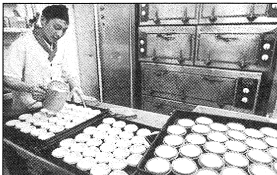
Traditional egg tarts

Recently the Hong Kong Government published a list of intangible cultural heritage items that the city should protect. The following were on the list: